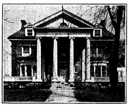
The Church of the Four Fold Gospel Battle Creek, Mich.

almost as large as the former assembly room. This wonderful addition estimated to cost $20000 was made possible by the consecrated, do-