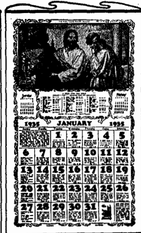
Single copy, 30c; 4, $1.00; 12, $3.00; 25, $5.75; 50, $9.00. All prices slightly higher in Canada.